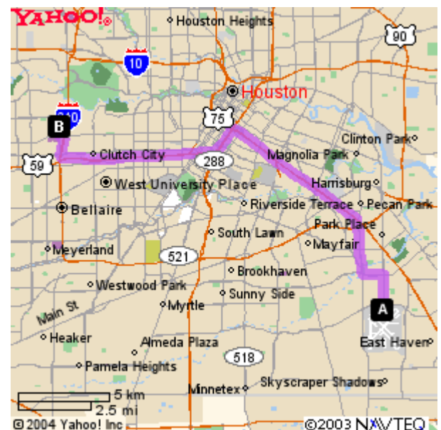
Hobby Airport (HOU), item A, is approximately 18 miles south-east of the Doubletree Hotel Post Oak, item B.